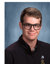
Sophia Vitantonio Beaumont School